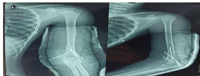
Fig. 4. Immediate Post-operative X-Ray.