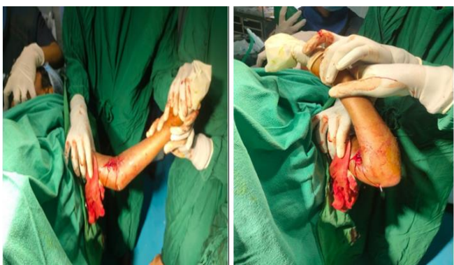
Fig. 2. Intraoperative clinical imaging of elbow