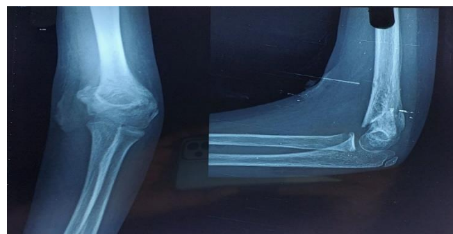
Fig. 5. Post-op x-ray images after removal of k wires

After the preoperative preparations, the patient underwent closed reduction of the fracture on an emergent basis. With application of continuous gentle traction, closed reduction was achieved & carefully 2 lateral and 1 medial Kirschner wires were pinned and checked by fluoroscopy. A long arm splint applied to the patient post-operatively in 40° flexion. After fracture reduction & stabilization, the swelling subsided gradually in 5 days. Surgical wound healing was satisfactory. The patient was discharged after 5 days & called for regular follow-ups. After 4 weeks, the Kirshner wires & splint was removed.