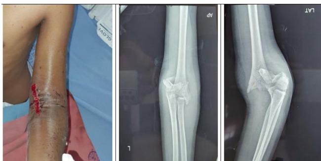
Fig. 1. Clinical image & Anteroposterior & lateral x-rays views showing supra-condylar fracture.

A 10-year-old girl was referred to our hospital (5 days post trauma) with a history of road traffic accident and complaining of pain, swelling at left elbow. Initially Patient was taken to local hospital with no distal pulse & finger movements, referred her immediately to vascular surgeon after colour Doppler study. Vascular injury got addressed & referred her back to previous hospital (after 5 days) for fracture fixation who referred her to our institute. On our first examination, it was observed that the elbow was swollen and there was a 4 cm linear surgical wound on the antero-medial surface of the left elbow & on neurovascular examination, distal pulses were feeble with flicker of movements in the fingers were seen. Radiographs showed us isolated supracondylar humerus fracture, extension type-III Gartland.